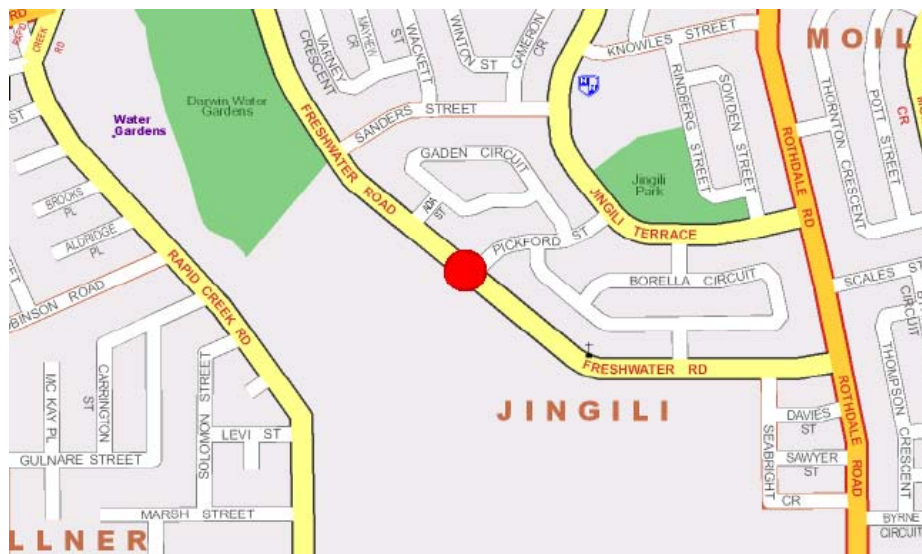
Figure 1:2 Feathers Sanctuary 49A Freshwater Road Jingili